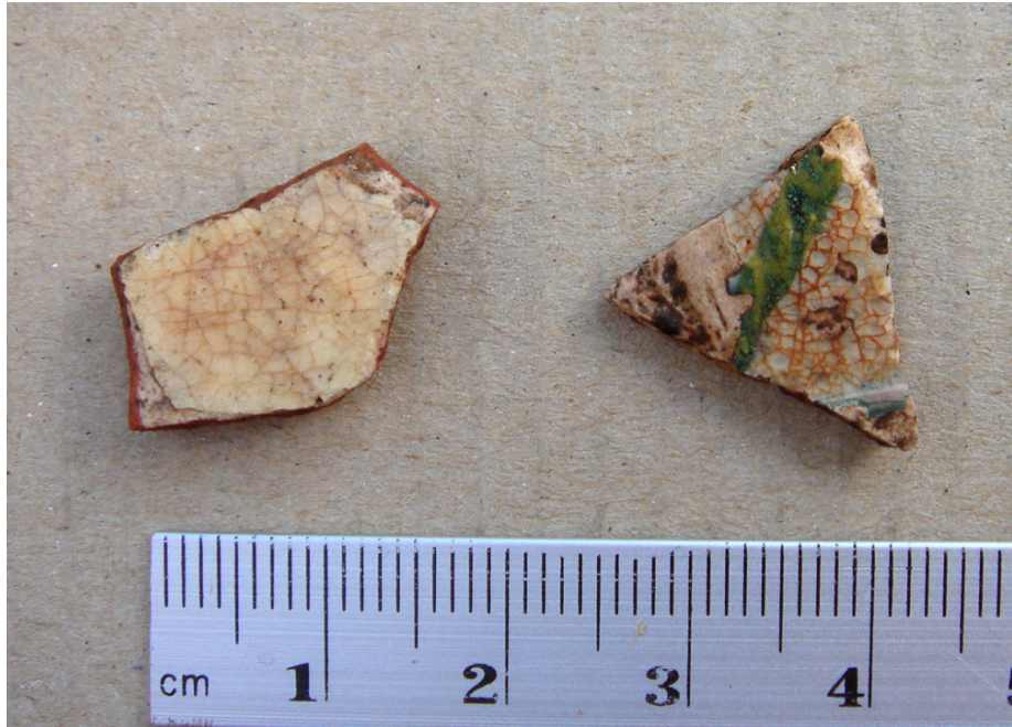
Pottery from day 2