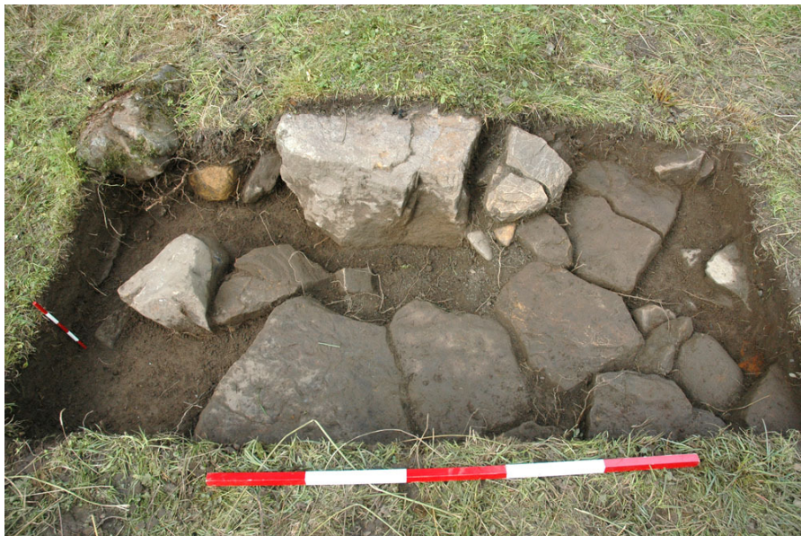
Trench 1 at the end of day 2 showing the flagged threshold. The inside of the building is on the left. Scales: 1m & 25cm.

Spread the word - that there's an active archaeology group in this area welcoming all comers. Excavations on Thursdays, 9am, currently meeting at the Spa Hotel "upper" car park, but you can come down any time.